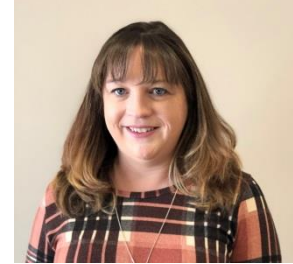
April Flowers Village Manor/ Christian Care Communities