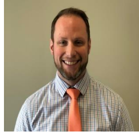
Sterling Borders Med Center Health